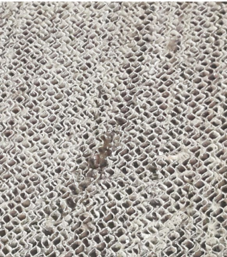
Without any water treatment, scale was hard like stones.