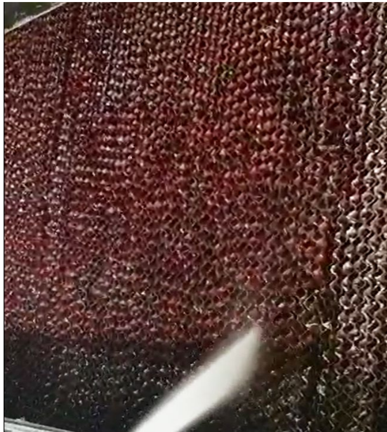
After Vulcan S10 had been installed for 2 weeks, scale had been softer and easily removed with a water gun.