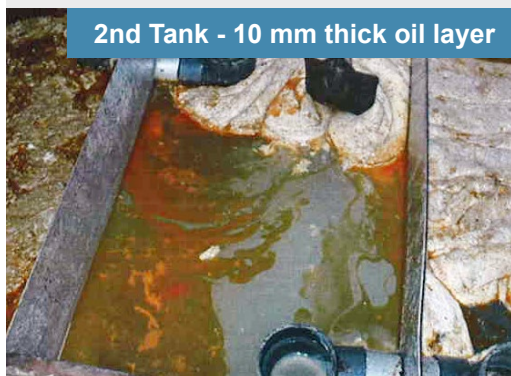
2nd Tank - 10 mm thick oil layer