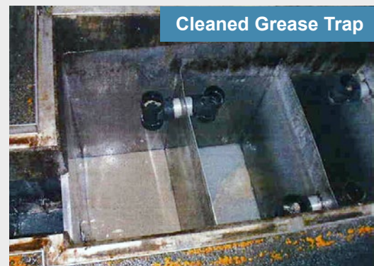
Cleaned Grease Trap