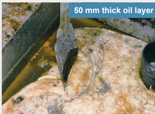
50 mm thick oil layer