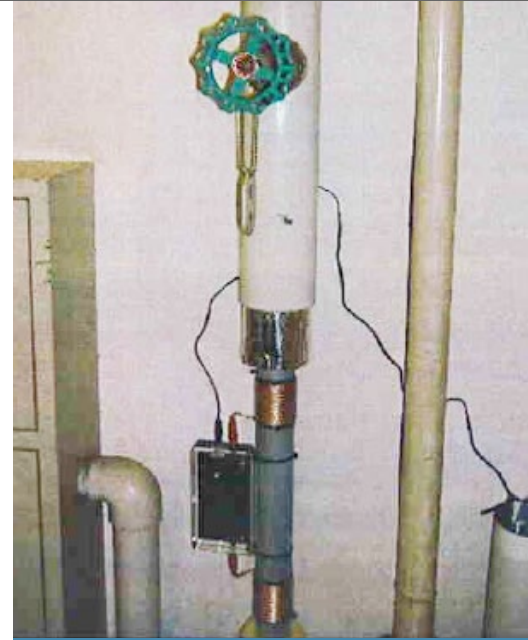
Vulcan 5000 was installed in the factory kitchen

As for the cleaning intervals, monthly cleaning may now not be required. The effect and cleaning intervals of Vulcan will require an annual observation, however, I believe the amount of cleaning will be reduced remarkably.