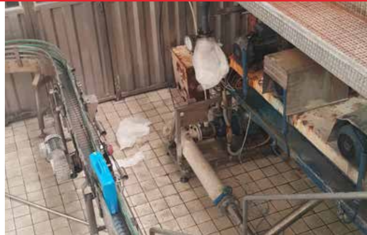
The Coca-Cola factory in Marrakech, Morocco