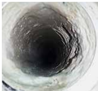
2 weeks after Vulcan was installed, scale had been softer and fallen out.