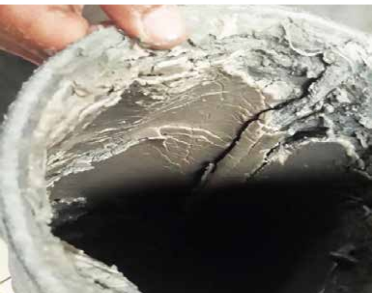
Without Vulcan, the filter was quickly stuck by scale deposits, and it had to be changed every 48 hours.