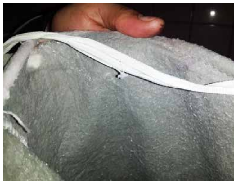
48 hours after Vulcan was installed, the filter still stays clean.