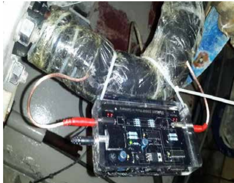
Vulcan 5000 was installed on the water inlet of the water recycling room.