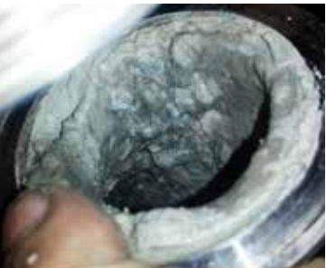
Before Vulcan installation: the pipe was full of scale deposits.