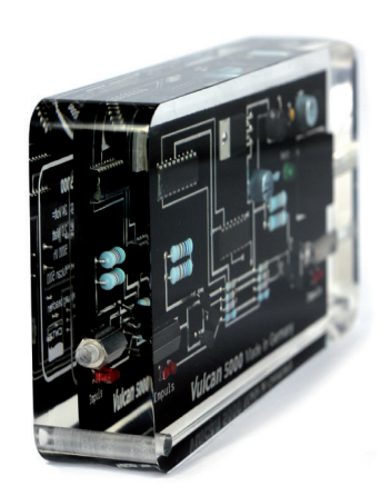
Long-life acrylic cast